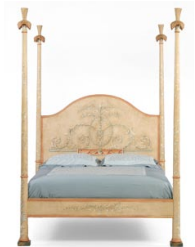
B19 FRIULI BED

For pricing and other information about these very special pieces, visit the Patina web site at: