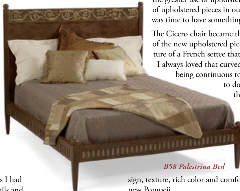
B58 Palestrina Bed

The results speak for themselves. Classic de-