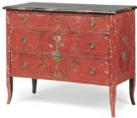
C70 FIRENZE CHEST

This month we are featuring 2 special items - A Friuli Bed, a Patina classic from the Original Collection and a Firenze Chest of Drawers, also from the Original Collection.